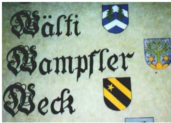
The Coat-of-Arms on the wall of the Lenk Public Building.

In the town hall of Lenk in the Upper-Simmen Valley there is a family coat of arms in the Clerk's office for Wampfler (Wampler, 1986). The immigration of Wampfler's from the Diemtigen area to the Upper-Simmen Valley area where Lenk is located is traced to the late 16th Century.