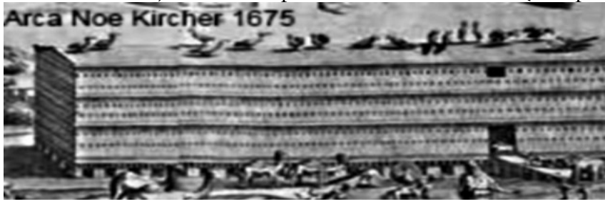
Noah in his reed covered ark was floating on an extremely flooded Aras/Araxes river and the landing spot was somewhere in that river valley. [The Aras/Araxes river being the river Gihon of Eden.]

"Upon the land. - The land is to be understood of the portion of the earth's surface known to man. This, with an unknown margin beyond it, was covered with the waters. But this is all that Scripture warrants us to assert. ... "All the high hills were covered." Not a hill was above water within the horizon of the spectator or of man. ..." . "Local tradition states that Nakhchivan (Azerbaijan city in the Aras river valley) was founded by Noah after the Flood, and was his place of death and burial" (Wikipedia-Nakhchivan)